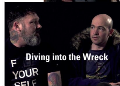
Diving into the Wreck